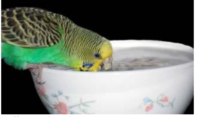
Coffee or chocolate.

This bird is on a cup filled with water. It might slip because the edge is not large enough for it to be secure. Reminder – don't give budgies any accesss to this much of any liquid. Also, they must never have any <u>tea</u>,